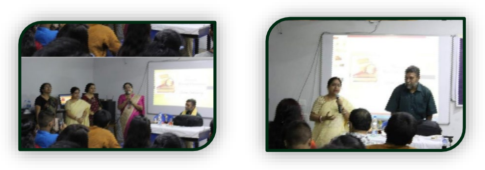
List of Participants: