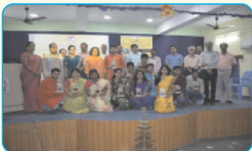
Celebration of National Science Day