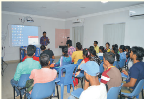
Class of certificate course going on