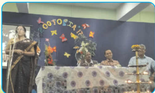
Alumni meet of Department of Zoology