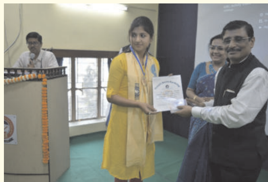
Certificate given by Pro-VC (Academic Affairs), CU