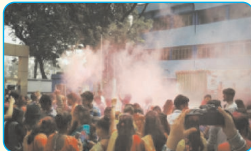
Celebration of Basanta Utsav