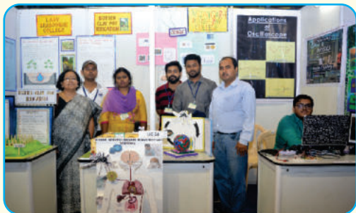
Our student in the Poster and Model Competition organised by the Department of Youth Welfare of W.B. Govt. at Netaji Indoor Stadium