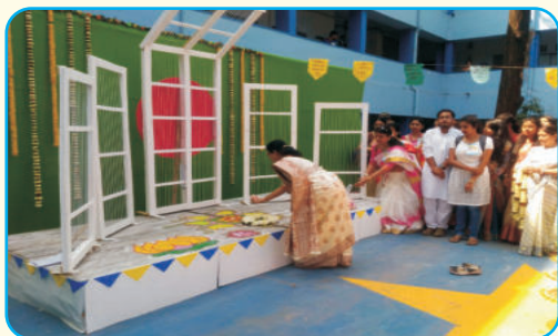
Celebration of Bhasa Dibas