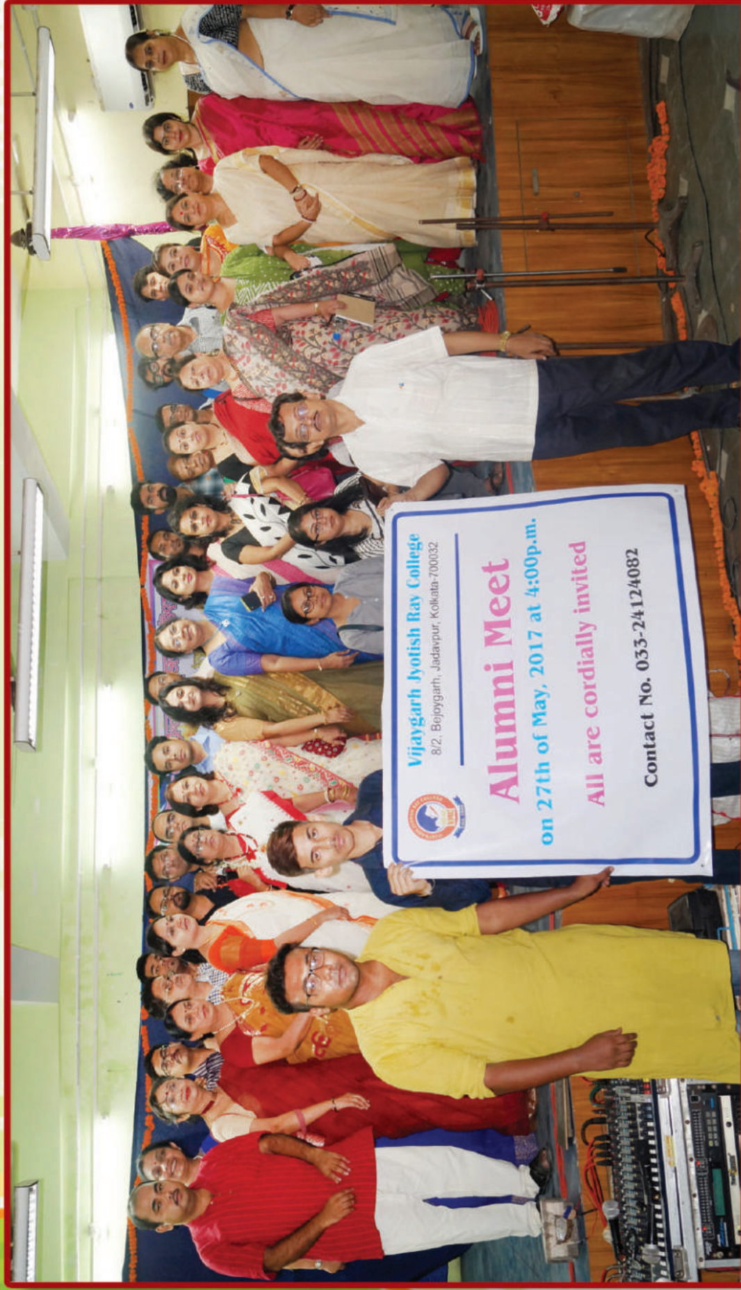
Alumni Meet on 67th Foundation Day