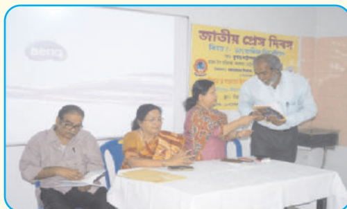
Celebration of National Press Day by Dept. of Journalism & Mass Communication