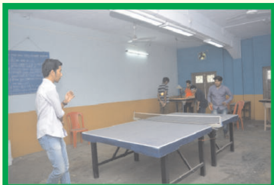
Boys' Common Room