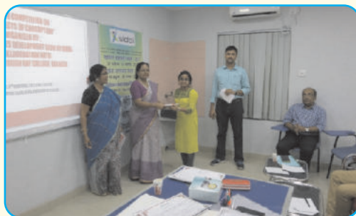
Observation of Anti-corruption Day