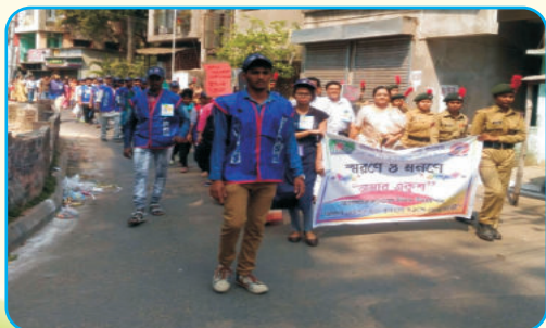
Padayatra on Bhasa Dibas