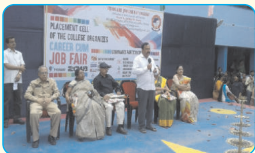
Career Cum Job Fair