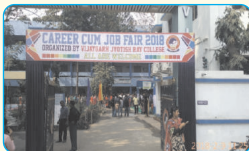
Career Cum Job Fair