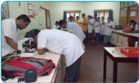
Microbiology (Under Graduate Laboratory)