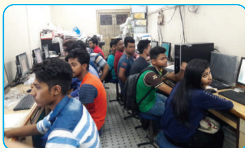
Computer Class in Computer Lab.