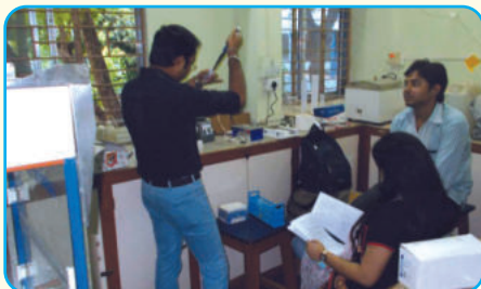
Microbiology (Research Laboratory)