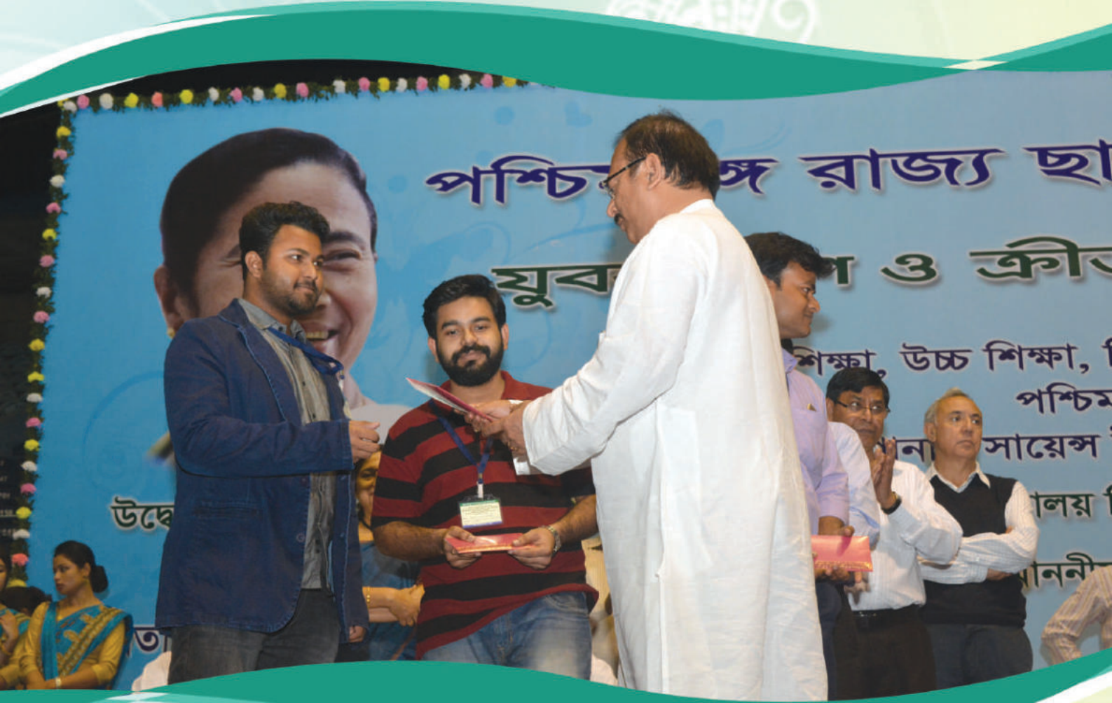
Receiving of award in Science Poster and Model Competition organised by Youth Welfare Department of West Bengal Govt. in Netaji Indoor Stadium