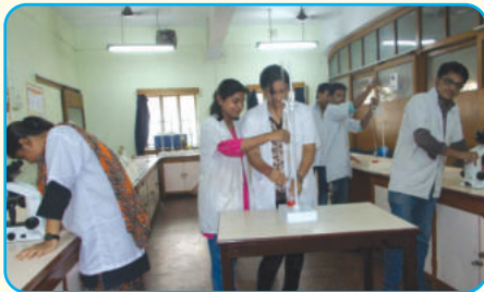
Microbiology (Post Graduate Laboratory)