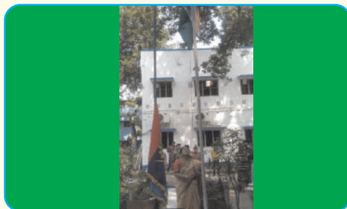
Flag hoisting on 26th Jan