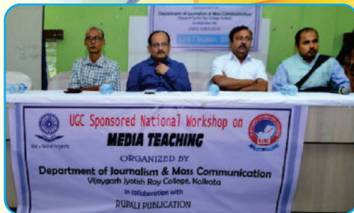
UGC Sponsored National Seminar