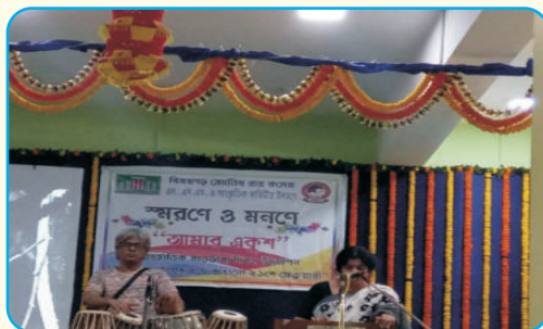
Cultural programme on Bhasa Dibas