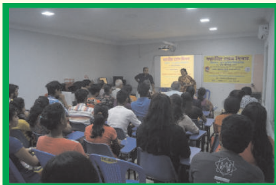
Virtual Class Room