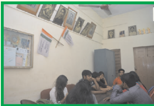
Students' Union Room