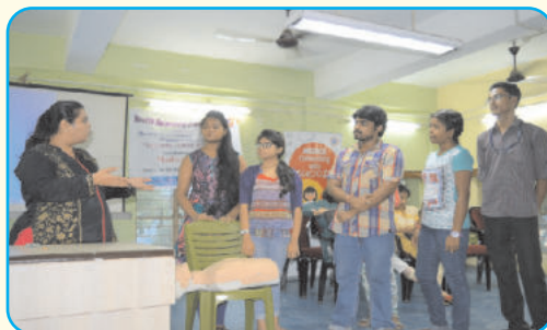
Health awareness programme by Medica Hospital