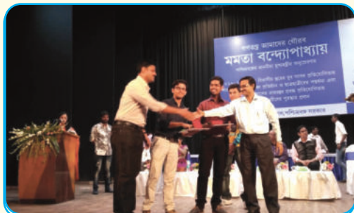
Receiving of award of Youth Parliament Quiz Competition