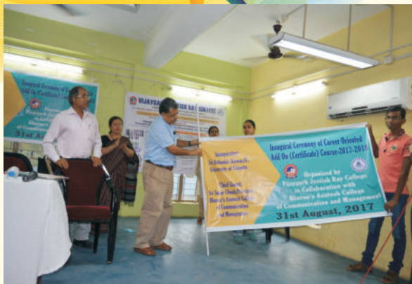
Inauguration of Certificate courses by Inspector of College, CU