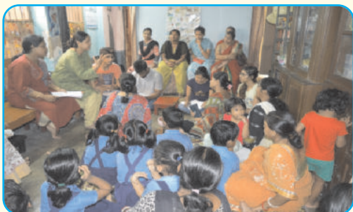
Community visit by Department of Physiology