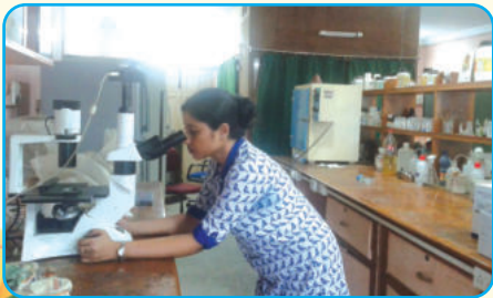
Research and Development Centre