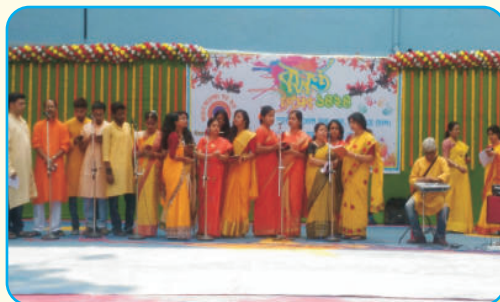
Celebration of Basanta Utsav