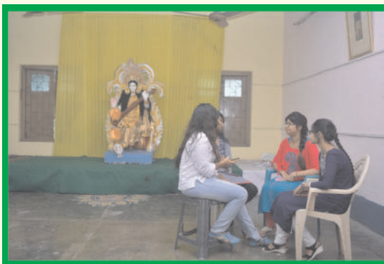
Girls' Common Room