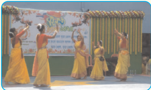
Celebration of Basanta Utsav